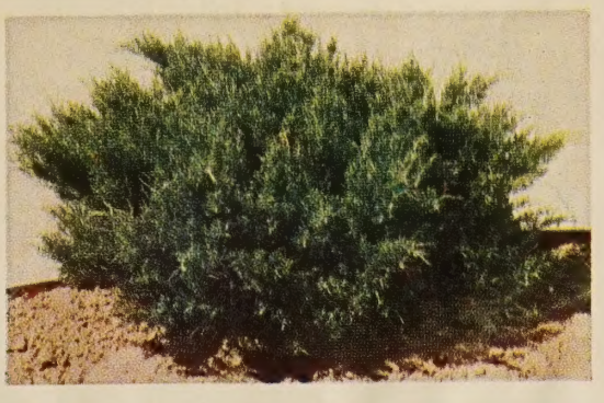
PFITZER JUNIPER: Low irregular growth, light green. Does well in shade.